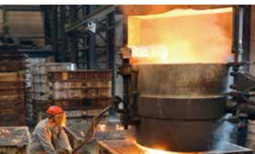
Iron and steel sector