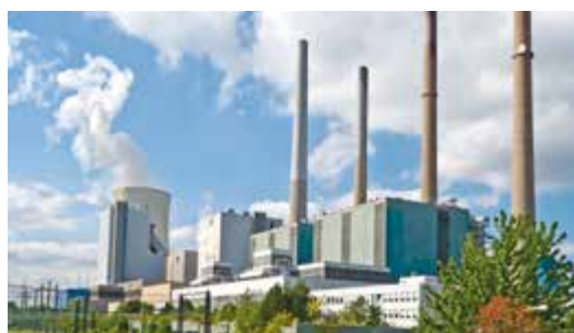
Chemical and plastic sector