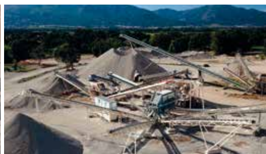
Aggregates and mining sector