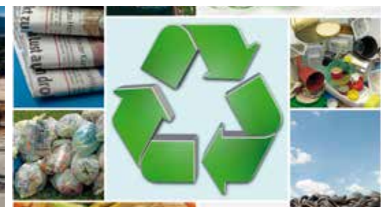
Recycling and waste sector