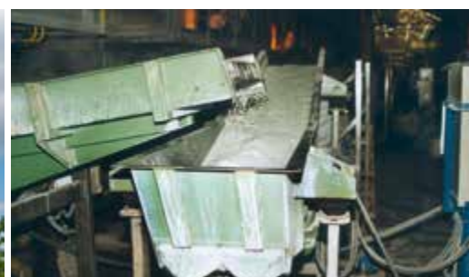
Ceramic and glass sector